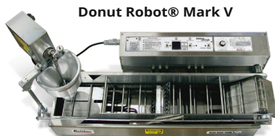
Donut Robot® Mark V

Standard Donuts 30 dozen/hour (360 donuts/hour) Mini Donuts 79 dozen/hour (948 donuts/hour)