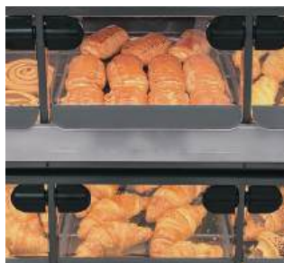
6 Product Cassettes