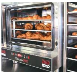
MONO Minibake Pro Convection Oven