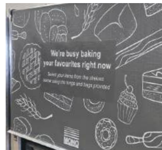
Heat Resistant Blind