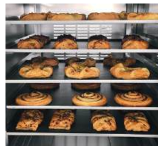
Integrated Storage Rack