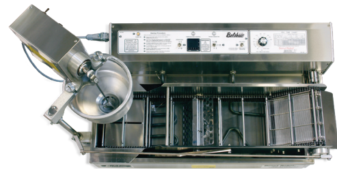
Donut Robot® Mark II - Mark II GP