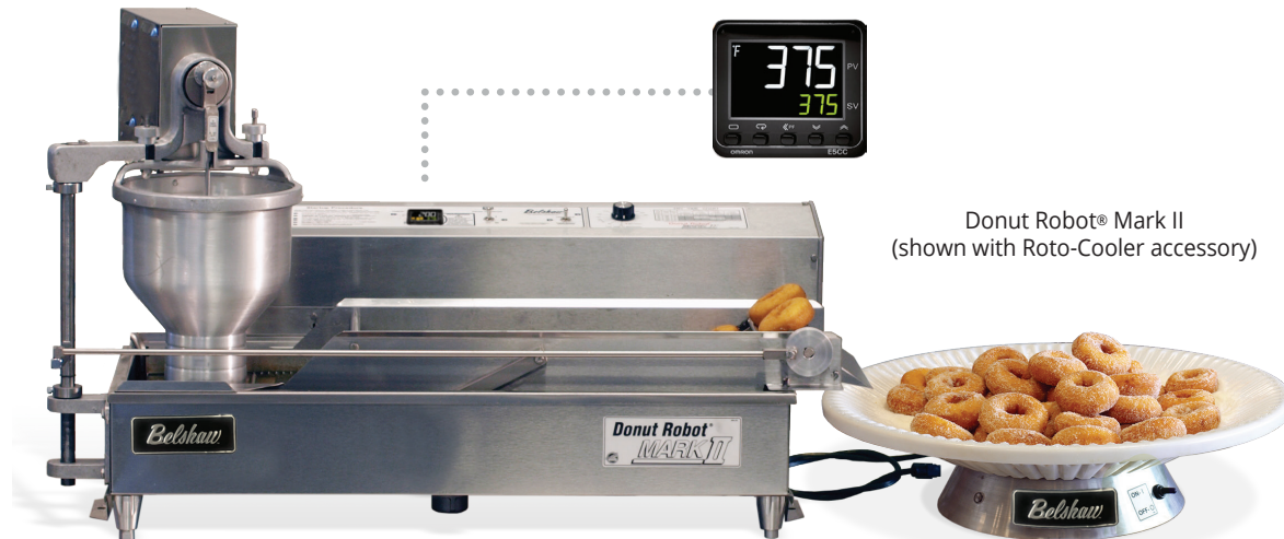
Donut Robot® Mark II (shown with Roto-Cooler accessory)

Belshaw's Donut Robot® fryers are highly versatile and can produce Cake Donuts, Mini Donuts, Ball Donuts (Donut Holes) and Raised Donuts. Training and labor requirements are minimal to produce a high quality, consistent product.