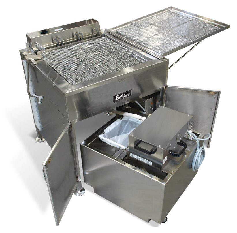
Electric open kettle fryer shown with optional EZMelt filter.

• Customer is responsible for ventilation hood, makeup air, and/or fire suppression as required by local codes.