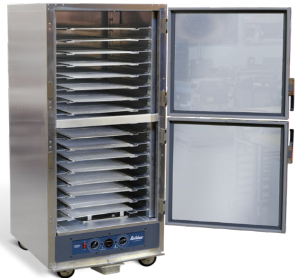
↑ Belshaw CP1/CP2 Cabinet Proofer (shown with donut firing screens)