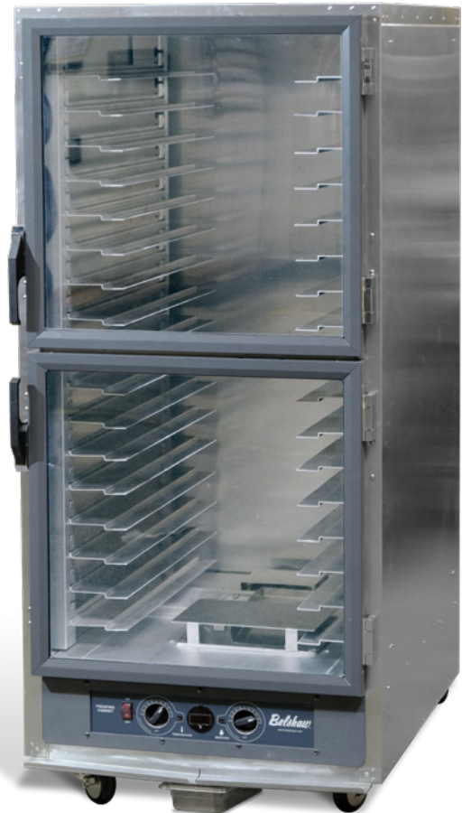
↑ Belshaw CP1/CP2 Cabinet Proofer