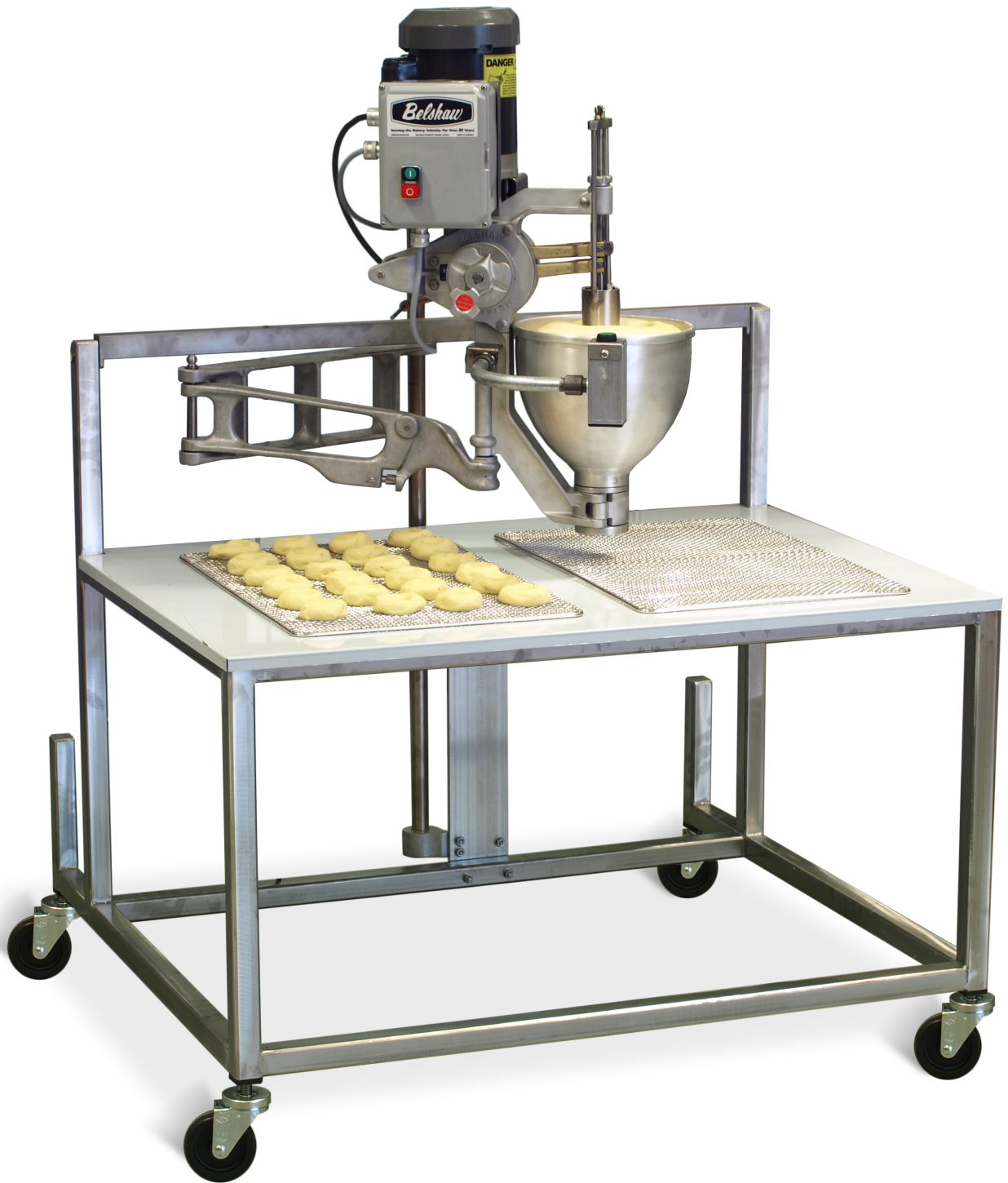
Figure 1.1 Type F-YRD shown with Depositing Table (optional accessory)