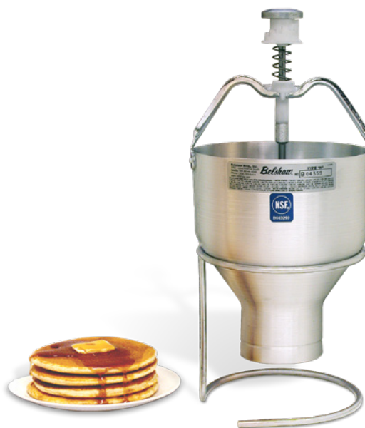
↓ Type K Pancake Dispenser with Holder (Item #K-1016WSS)