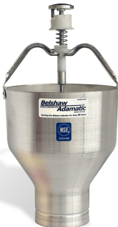
↑ Type K Pancake Dispenser (Item# 8504011)