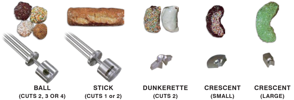
BALL (CUTS 2, 3 OR 4)

Type B & F plungers are identical. Type N plungers are sized for Type N only. The French Plunger will make French Crullers with French Cruller mix, or French Cake donuts with standard mix. For size and weight details, see over page.