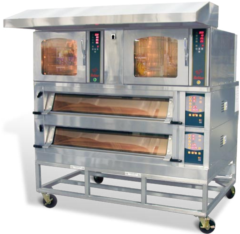
Belshaw Combination Convection/Deck Oven

BX ovens feature two electronic programmable controller choices. The Classic controller is capable of storing up to 9 different programs. The state-of-the-art Smartbake controller provides a color display, storage of up to 99 programs and is perfect for exhibition-style baking. BX ovens are designed to accommodate industry standard 18"x26" trays.