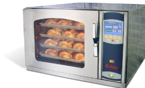
◀ BX4-2618-Smartbake (4-tray)