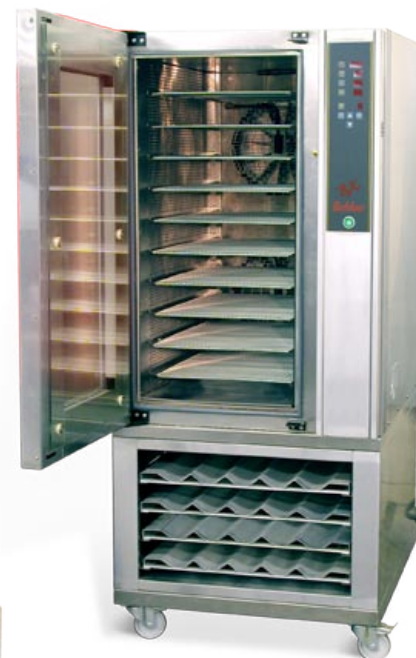
BX10-2618-S (10-tray) ▶