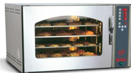
BX4-2618-Classic (4-tray) ▶

BX Ovens are fitted with vented doors with 'cool to touch' double glazing. Air flow between the panes provides cooler glass and surrounding metalwork and saves energy by reducing heat loss.