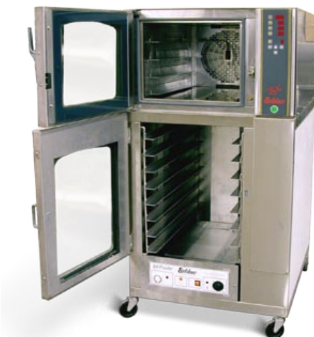
◀ BX4-2618-C + BX Proofer