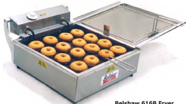
Belshaw 616B Fryer

Tempura makers find the Belshaw 616B's small size, shallow depth and overall simplicity ideal for tempura frying.