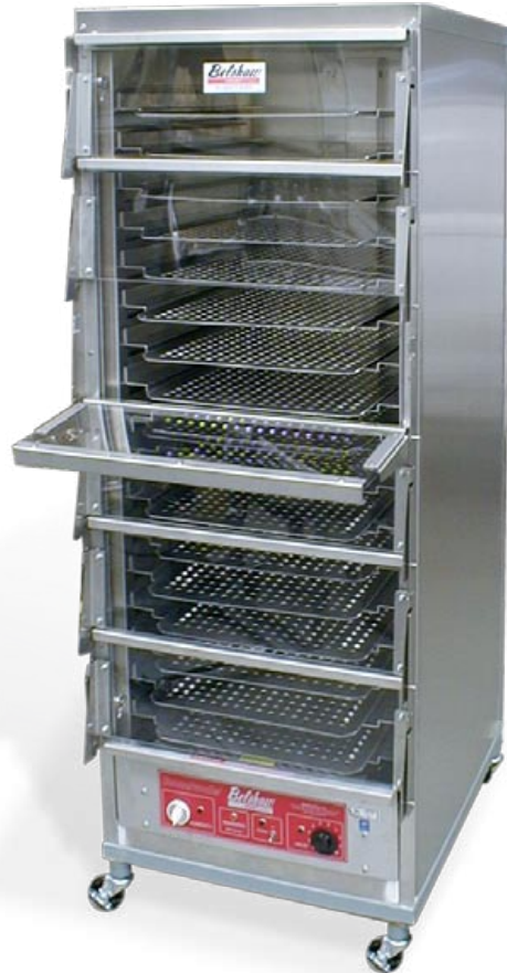
Belshaw EP18/24 Proofer

1 Capacity measured at a proofing time of 30 min.