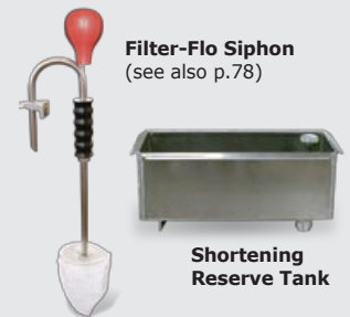
Filter-Flo Siphon (see also p.78)

The Filter-Flo is a heavy duty siphon that removes and filters shortening. One squeeze of the bulb starts the flow which can empty a Mark II in a few minutes. A reusable cloth filter cleans as liquid passes through. The Shortening Reserve Tank melts and holds new shortening ready for adding to the fryer as needed.