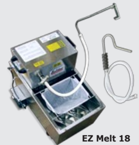
EZ Melt 18 (see also p.78)

Shortening drains from the fryer directly to the long-life polypropylene filter, and pumps back in with a foot pedal. Filtering more regularly lengthens shortening life and reduces the cost of new shortening. Shortening cubes can be melted right in the filter.