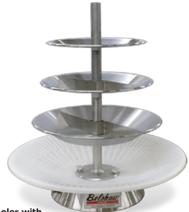
Roto-Cooler with Finishing Tree

Belshaw's three Roto-Cooler versions are the most practical way to collect, hold and cool donuts fried on Donut Robot® Mark II, V and IX fryers. They are rotating round trays, attractively finished, and powered by a connection to the fryer.