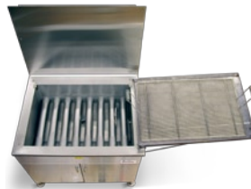
734 gas fryer (34" x 24")