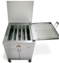
718L gas fryer (18" x 26")