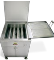
718LCG gas fryer (18" x 26")