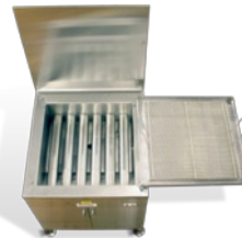
724 gas fryer (24" x 24")