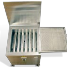
724CG gas fryer (24" x 24")