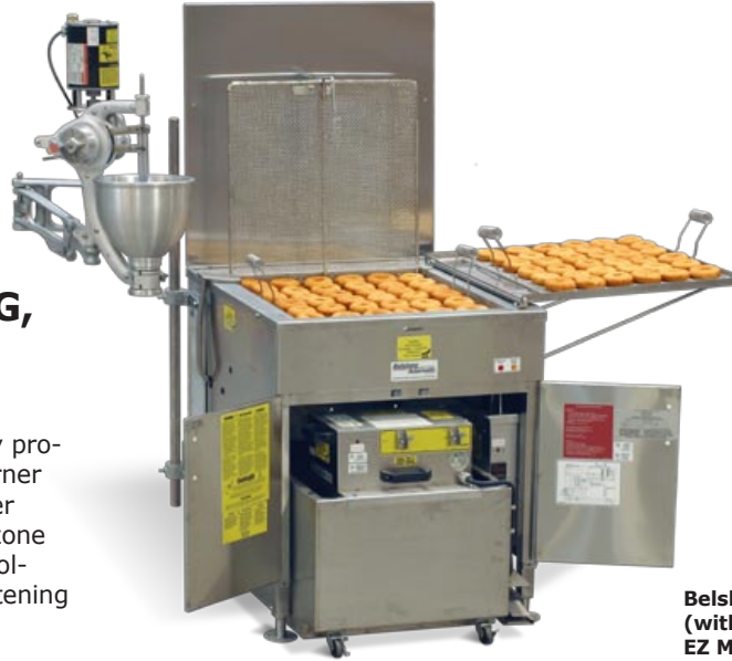
Belshaw 724CG Gas Fryer (with Type 'F' donut depositor, EZ Melt filter and submerger)