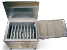
734CG gas fryer (34" x 24")