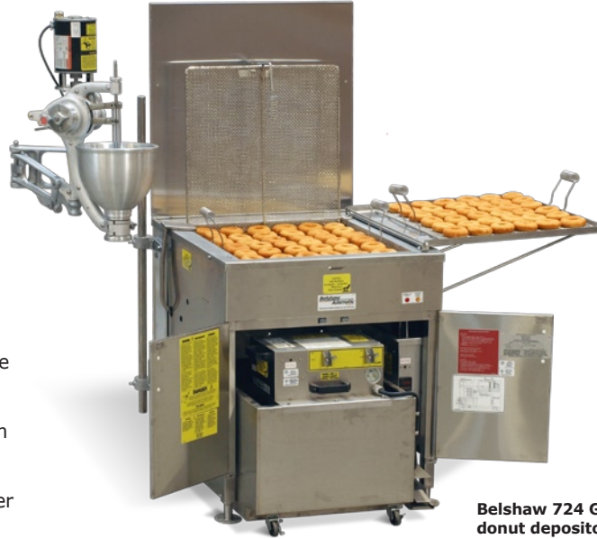
Belshaw 724 Gas Fryer (with Type 'F' donut depositor, EZ Melt filter and submerger)